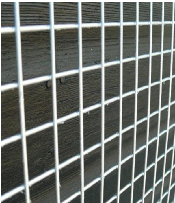
Fine Underside Mesh

“ I am really pleased with the work - they have done a brilliant job. Thanks a lot, Rapid Ramp! ”