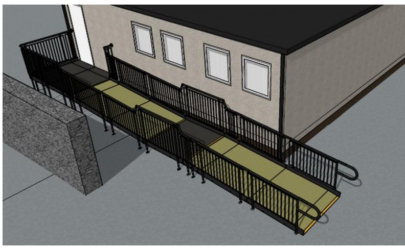
TE UNIT RAMP A